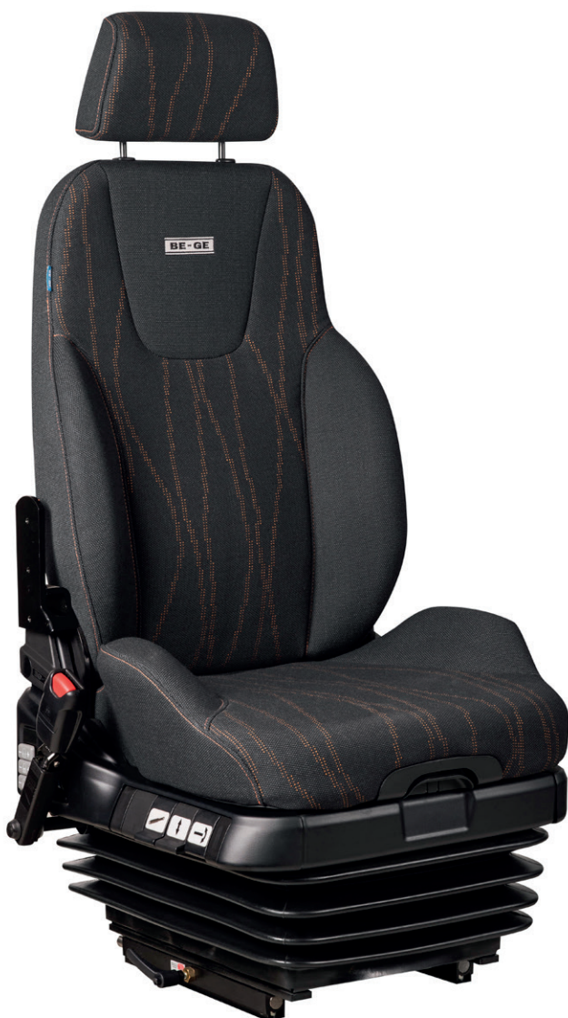
The seats illustrated are fitted with extra items.